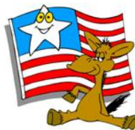
Sun City Democrats