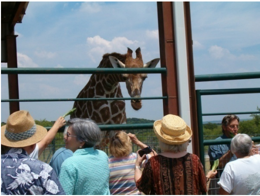
Stretch, the giraffe.