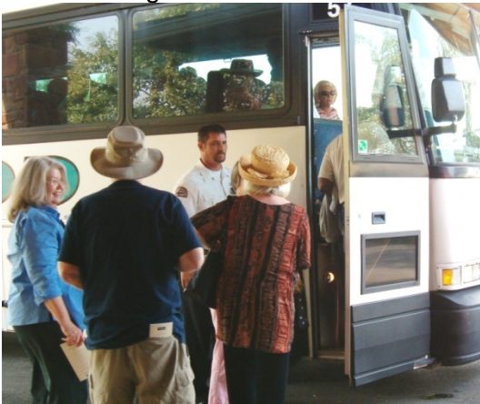
The company's web site is www.texasdisposal.com .

We all left with a much greater appreciation of the seemingly mundane but absolutely vital business of waste management.