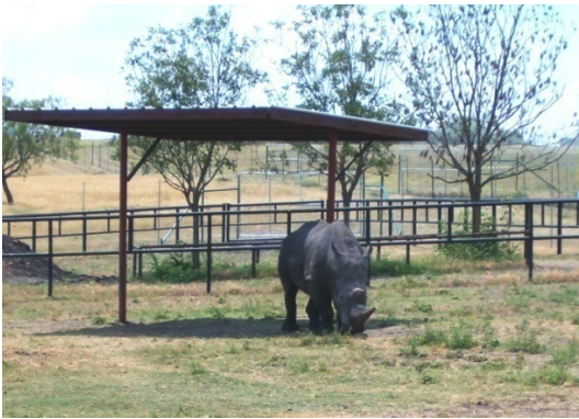
Rowdy, the rhino. He sensibly stayed in the shade, unlike the humans trying to entice him closer.