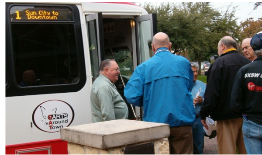
12/08/08 First bus