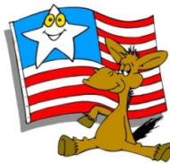
Sun City Democrats

It shall be the policy of the Sun City Democrats Club that its membership roster and database shall be considered an asset which is to be used only by the club for the purpose of promoting the activities of the club. The information in these documents should not be sold or divulged to others. The custodian of the database shall be the membership chair and those persons whom he/she designates to help with the communication needs of the club.