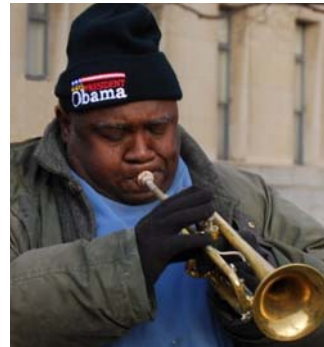
On Pennsylvania Avenue