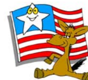
Sun City Democrats

2. They renewed the no-bid land fill contract with Waste Management over objections by many who wanted time to study the danger to residents nearby and to groundwater.