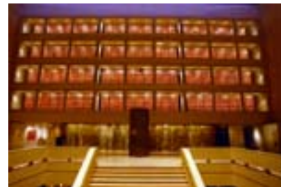
National Archives at LBJ Library and Museum