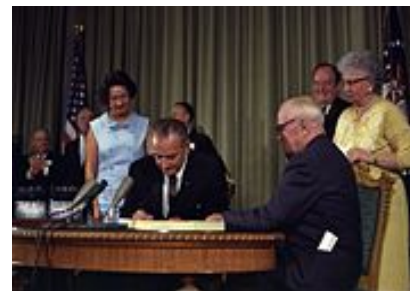
LBJ signs bill while Harry Truman looks on