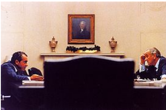
Richard Nixon and Lyndon Baines Johnson

Williamson County Obama Store is located at the Williamson County Democratic Headquarters, featuring T-shirts, hats, posters, calendars, etc.