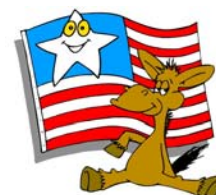
Sun City Democrats