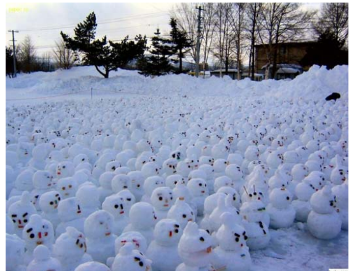
Massive Global Warming Protest