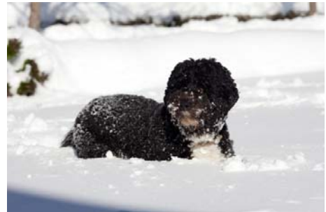
Bo in the Snow on the White House Lawn