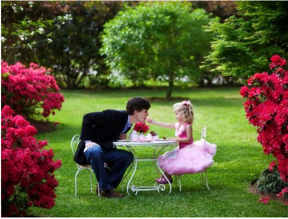
Best "Tea Party" Photo Ever