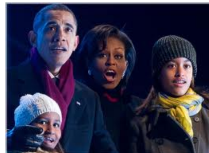
Obama family at lighting of the National Christmas Tree 12-2010