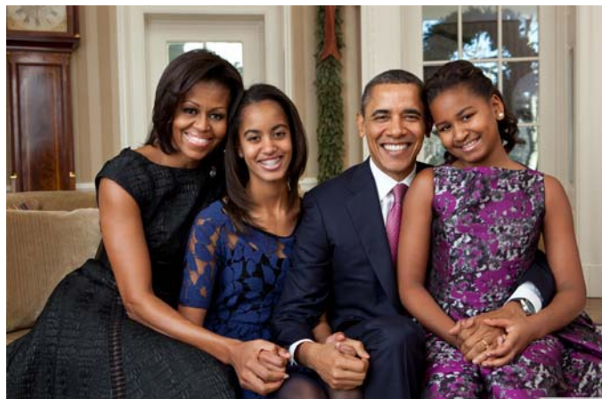
Obama Family Portrait taken December 11, 2011 Michelle, Malia, Barack, and Sasha