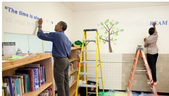
Obamas paint during Martin Luther King Day of Service.

You can download the complete report here.