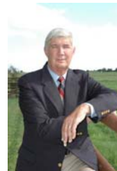
County Judge Dan Gattis