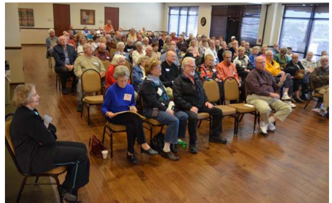
Sun City Democrats in their new meeting room at the Sun City Cowan Creek Activity Center.